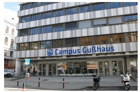
Neues El